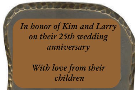
**Large Brass Rock